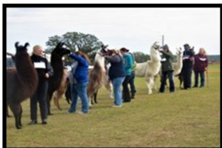
Annual Florida Winter Classic Fun Show! January 27, 2024

Here are just some of our yearly events our members enjoy.