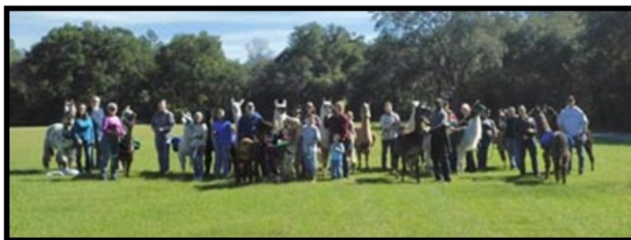
Annual Meeting, Picnic and Alpaca / Llama hike! November 5, 2023

Go to www.falainc.com to join our community!