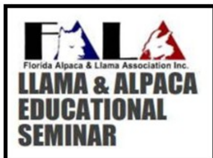
Free Educational Seminar July 22, 2023